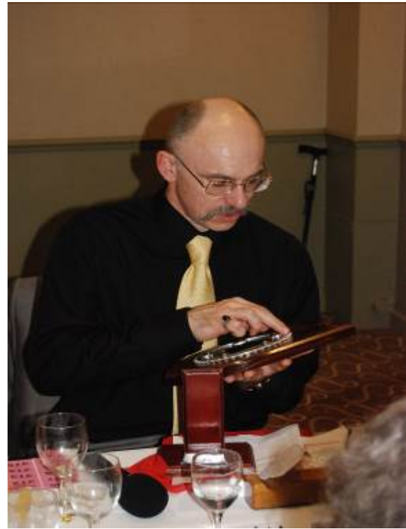
Now, how do you turn these ipads on??